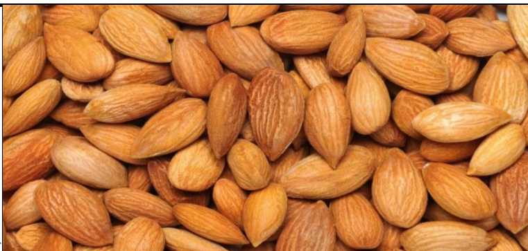
Almond prices (prompt) development

As usual if you have any question please feel free to give me a call